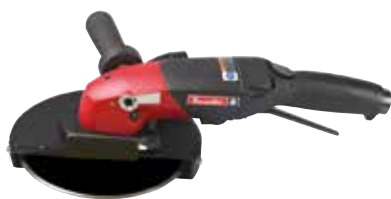
DUST EXTRACTION KIT KA26 CUTTING 615 397 844 0