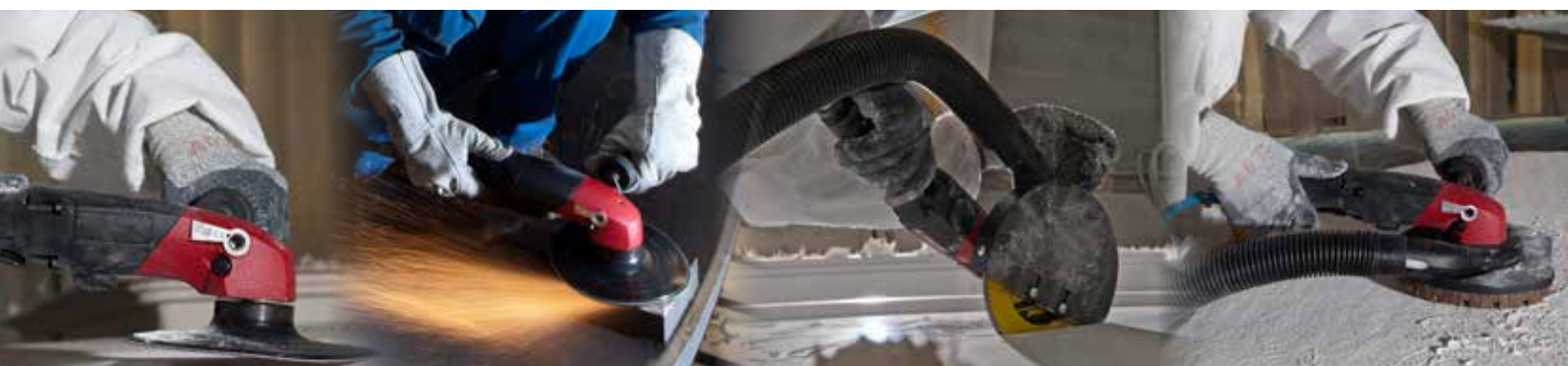
DIAMOND DISC CUTTER Ø180mm 615 811 145 0