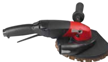
DUST EXTRACTION KIT KA26 Ø180mm 615 397 843 0