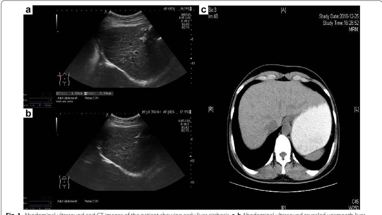
Fig. 1 Abodominal ultrasound and CT images of the patient showing early liver cirrhosis. a , b Abodominal ultrasound revealed unsmooth liver surface, irregular edges, enhanced thickening dot echoes and uneven distribution with several slightly hyperechoic nodules. c CT of the upper abdomen showed that the hepatic capsule was wavy