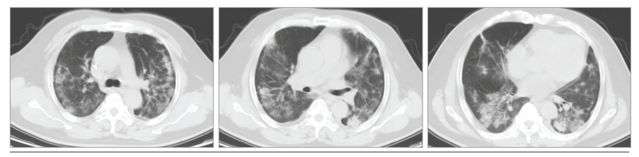
A, Chest computed tomographic images obtained on January 7, 2020, show ground glass opacity in both lungs on day 5 after symptom onset. B, Images taken on January 21, 2020, show the absorption of bilateral ground glass

B Computed tomography images after treatment on day 19 after symptom onset