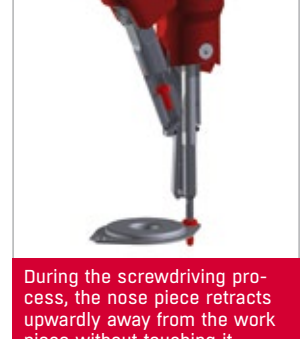
cess, the nose piece retracts upwardly away from the work piece without touching it