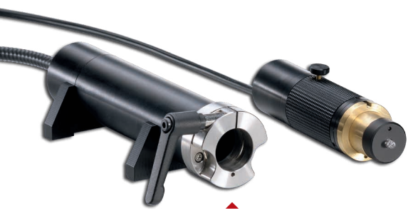
Adapter and test socket for averaged LED intensity measurements.