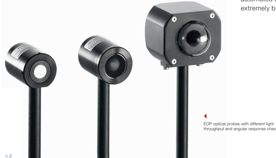
throughput and angular response characteristic.

Like all spectrometers from Instrument Systems, the CAS 120 can be combined with any of a large number of adapters and other accessories using fiber-optic cables to permit a wide range of different tasks for one spectrometer. This enables the CAS 120 to be deployed efficiently in production, quality assurance, as well as in research and development. The integrated density filter wheel and the darkcurrent shutter also facilitate fully automated measurements over an extremely broad signal range.