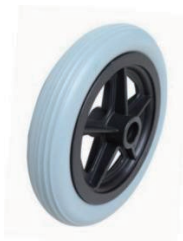
W03(6'',8'') PU wheel