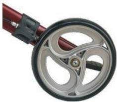
W01(6'',8'') Silver PVC wheel