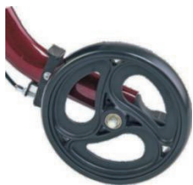
W04(6'',8'') Black PVC wheel