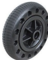
W06(6'',8'') PU wheel