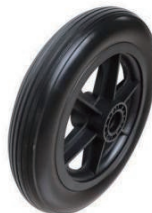
W09(6'',8'') PU wheel