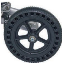
W02(6'',8'') PU wheel