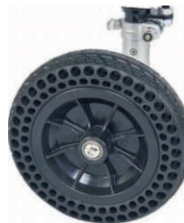
W05(6'',8'') TPE wheel