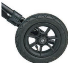
W07(6'',8'') Rubber wheel