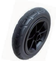
W08(6'',8'') Rubber wheel